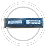
ThinkServer 8GB DDR3L-1600 MHz ECC UDIMM