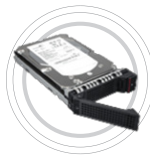
ThinkServer 1TB 7.2K 3.5" Enterprise SATA 6Gbps Hard Drive

Boost the capabilities of your ThinkServer and increase performance by adding memory.