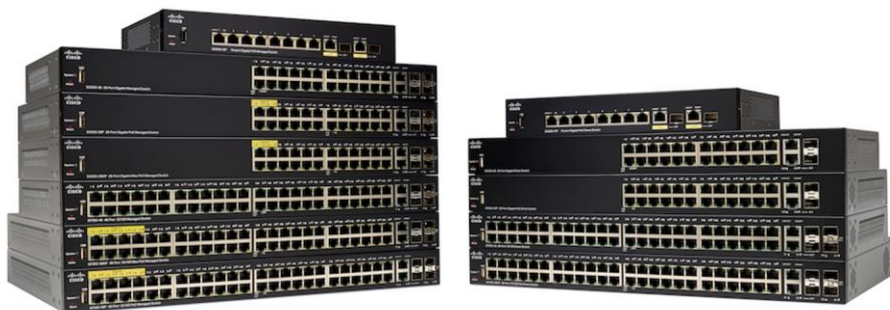
Figure 1. Cisco 250 Series Smart Switches

The Cisco 250 Series is the next generation of affordable smart switches that combine powerful network performance and reliability with the essential network management features you need for a solid business network. These expandable Fast Ethernet or Gigabit Ethernet switches provide basic management, security, and quality-of-service (QoS) features beyond those of an unmanaged or consumer-grade switch, at a lower cost than managed switches. And with an easy-to-use web user interface, Auto Smartports, and flexible Power over Ethernet (PoE) Plus capability, you can deploy and configure a complete business network in minutes.